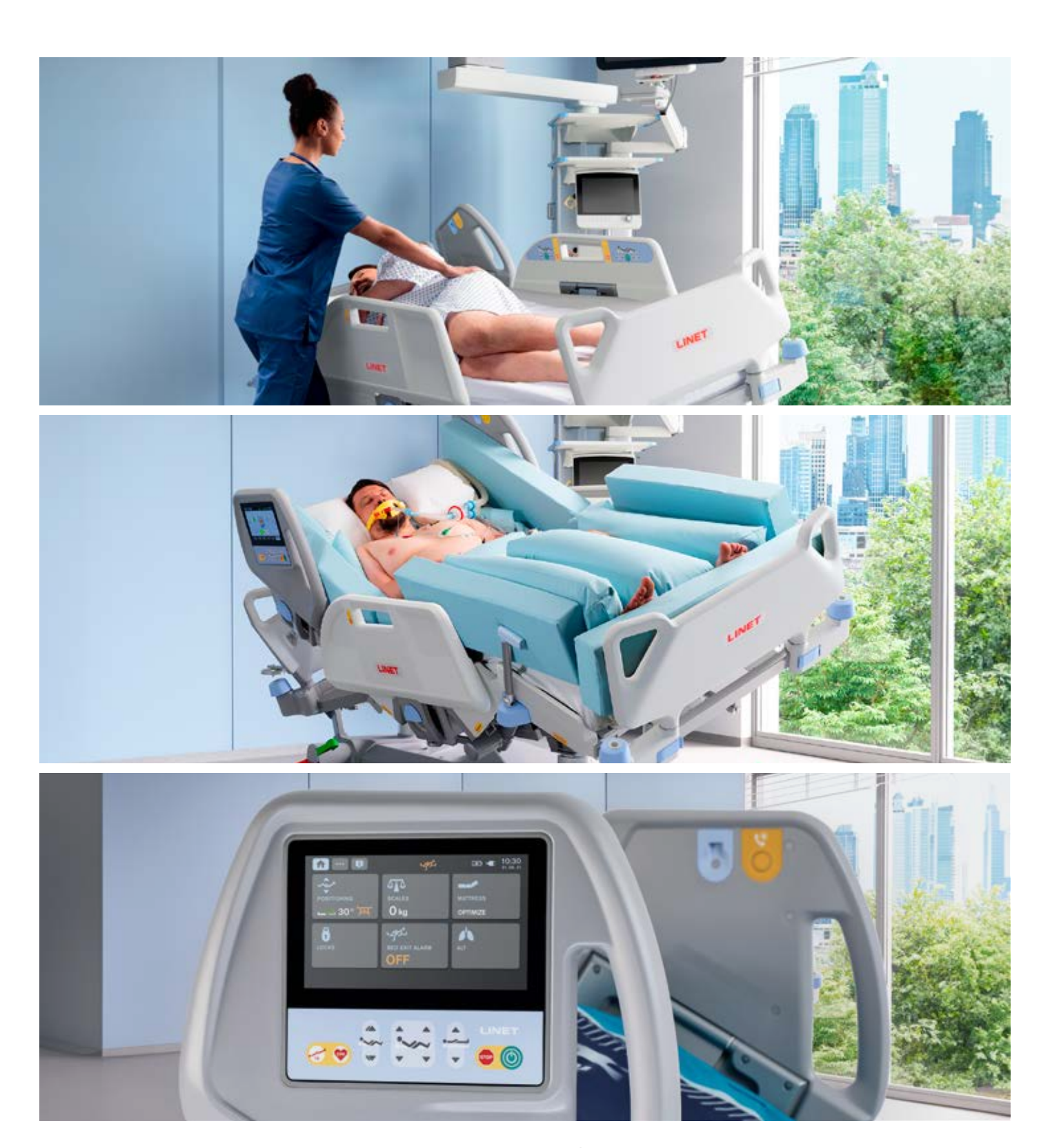
Premium ICU Bed Designed by Nurses for Nurses