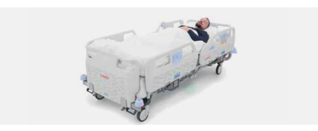
Incredible versatility that meets all the needs of each individual department. Bespoken design is an additional bonus.