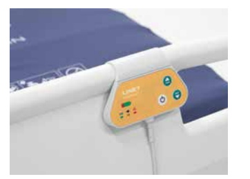
EasyDrive® enables effortless patient transportation done by one caregiver without need of any initial push force for acceleration.<sup>3</sup>