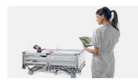
SafeSense 3 helps to save time by providing a real-time overview of the patients' position in the bed or by smart alerting when the patient is at risk of pressure injuries or falls.