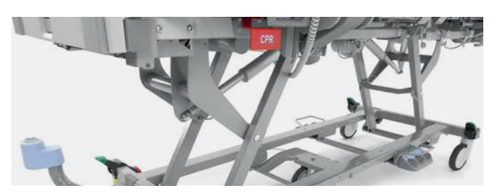
Single platform efficiency brought by one intuitive user interface. This means only one training for nurses and easier rotation across hospital wards.