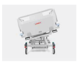
Lateral tilt turns into a new gold standard in acute care reducing physical strains on the caregiver by 67%.<sup>1</sup>