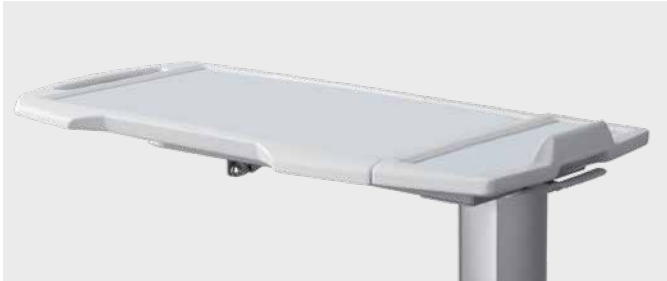
Moulded tabletop (available in White only)