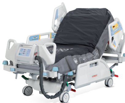
Virtuoso with zero pressure and 3-cell technology.

Multicare LE open architecture allows the use of various mattress systems for the prevention or healing of pressure ulcers according to the needs of the patient.