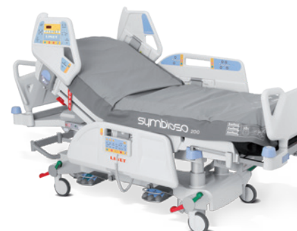
Symbioso with integrated design.