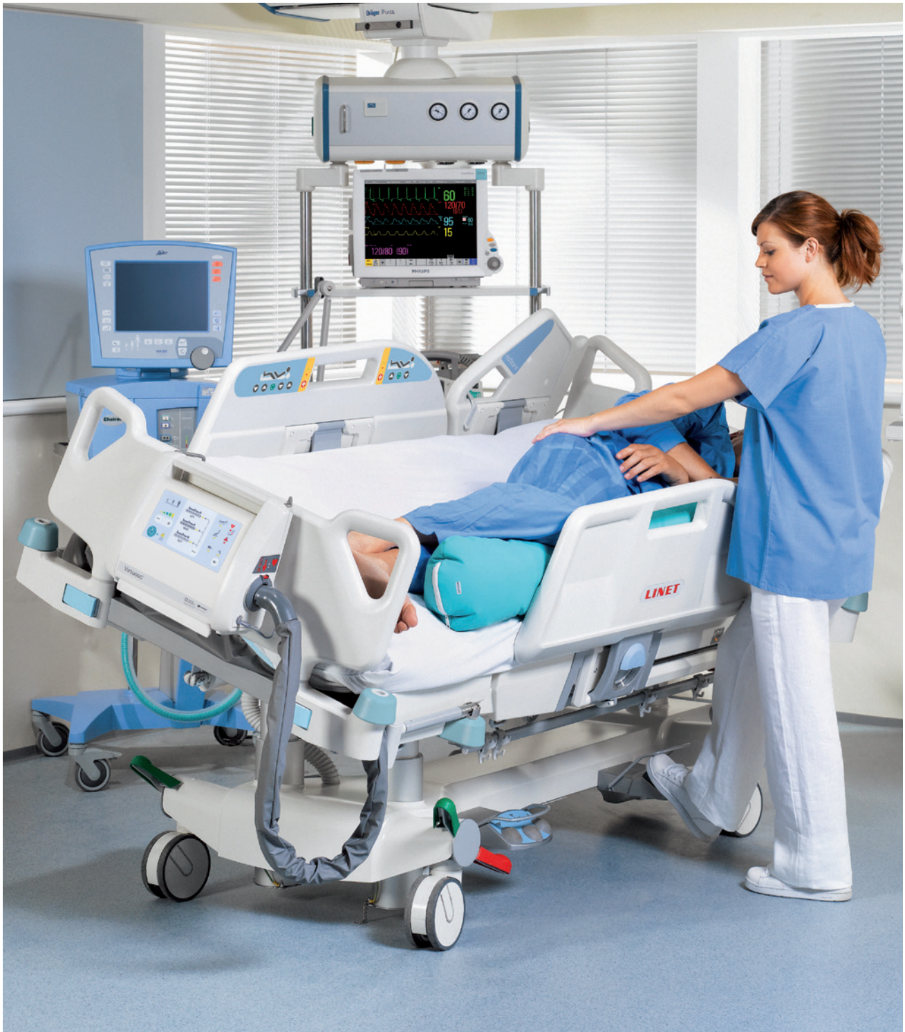
Critical Care Bed