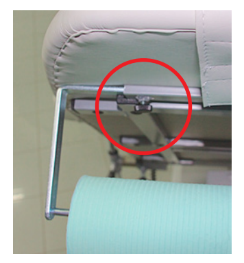
Release the holder slider by loosening the fly nut, and adjust the paper size.

The foot segment slope is set by rotating the lever aside, and by releasing the lever after the required position is set. Maximum load of the set foot part is 60 kg. (Do not sit down!)