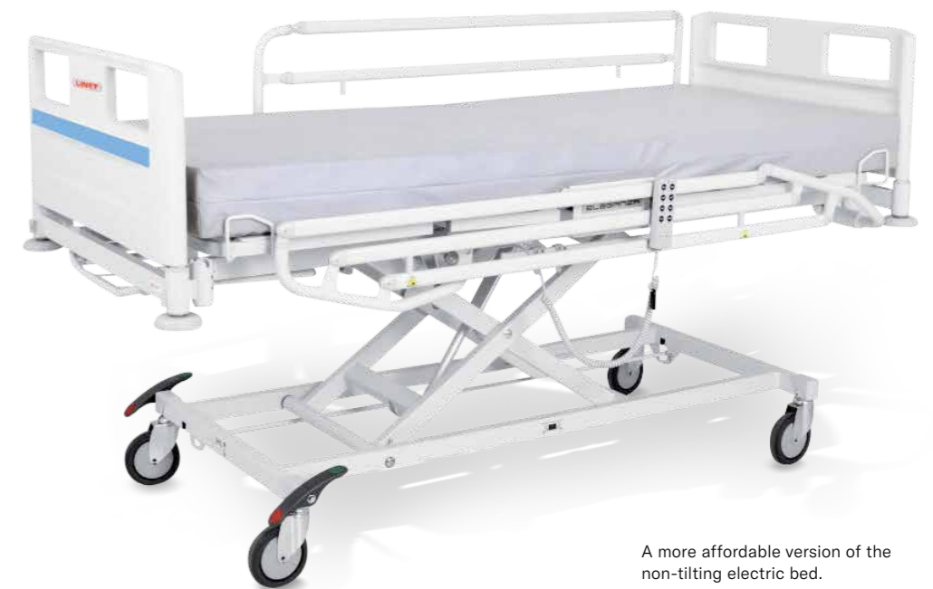
A more affordable version of the non-tilting electric bed.