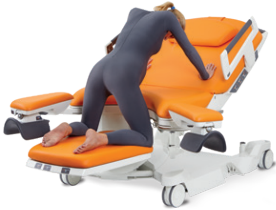
All fours position