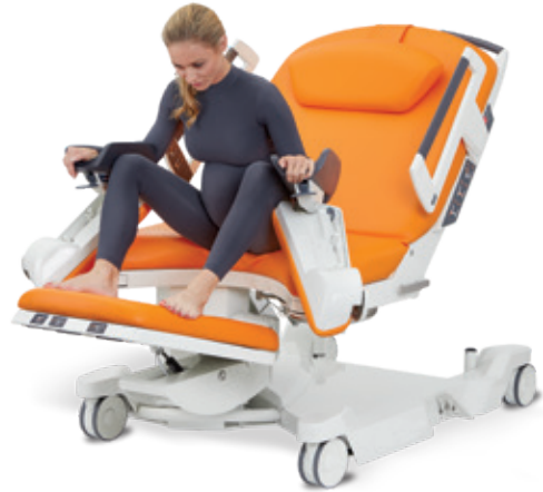
Half sitting using leg holders