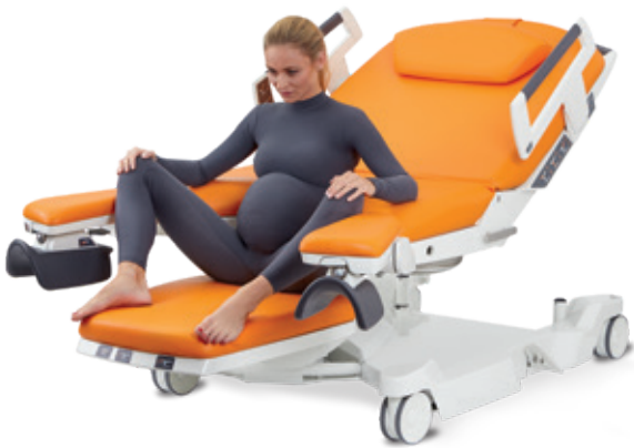
Half sitting using foot section