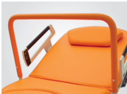
Supporting upholstered bar