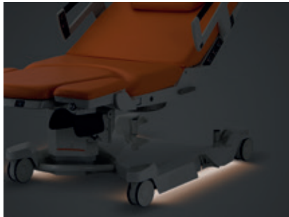
Under bed light