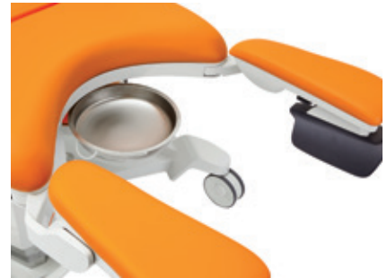
Sliding stainless catch basin 4.5l