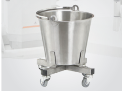
Stainless steel bowl with castors