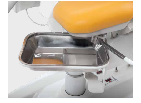
Stainless steel bowl