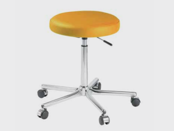
Physician's chair – ergonomic, adjustable feet