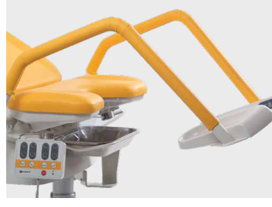
Leg supports with upholstery