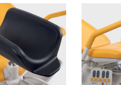
Leg rest Goepel type