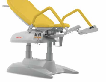
M – Corn yellow