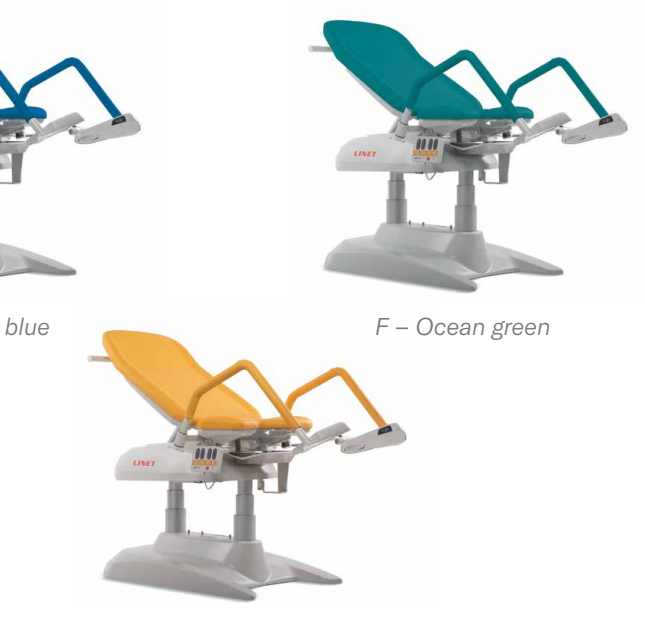
P – Orange