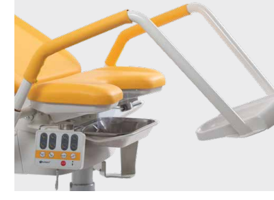
Leg supports with partial upholstery