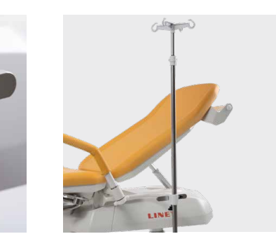
Infusion stand holder