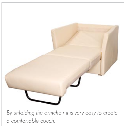
By unfolding the armchair it is very easy to create a comfortable couch.